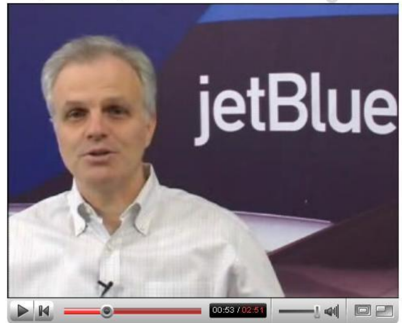
jetBlue - an American airline company